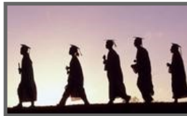
2018 Senior Graduates